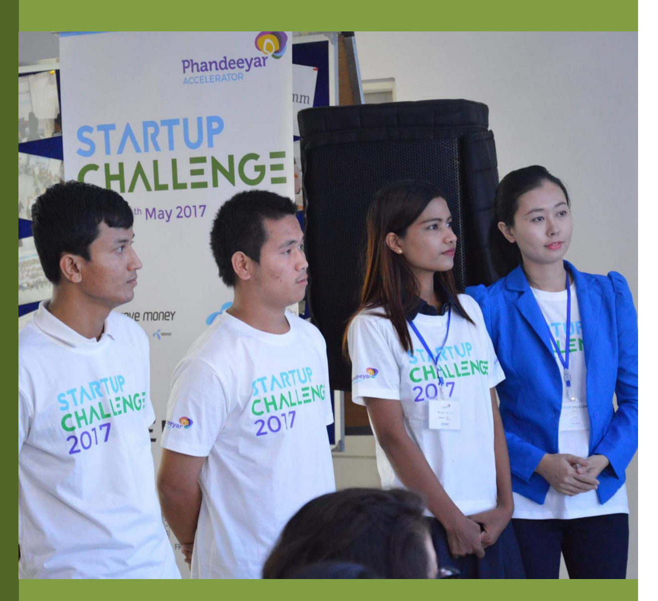
RecyGlo received the 1st prize at the Phandeeyar Startup Challenge